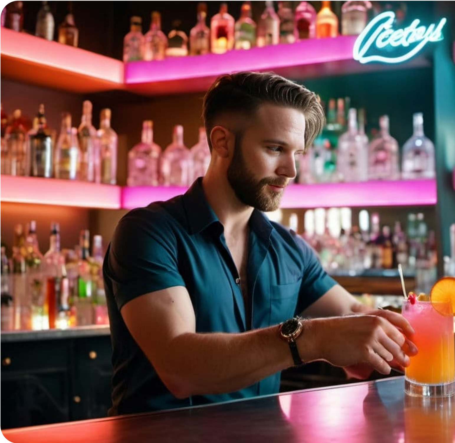
Emerging Trends in Houston's Bartending Scene: A 2024 Outlook

Ingenuously blending entertainment that is show stopping, interaction, sensory stimulation, and local style into night-out events creates excitement today...and unforgettable memories that draw patrons back again and again. Cultural Diversity and InclusionHouston's diverse culture is now being seen more prominently in the nightlife scene.