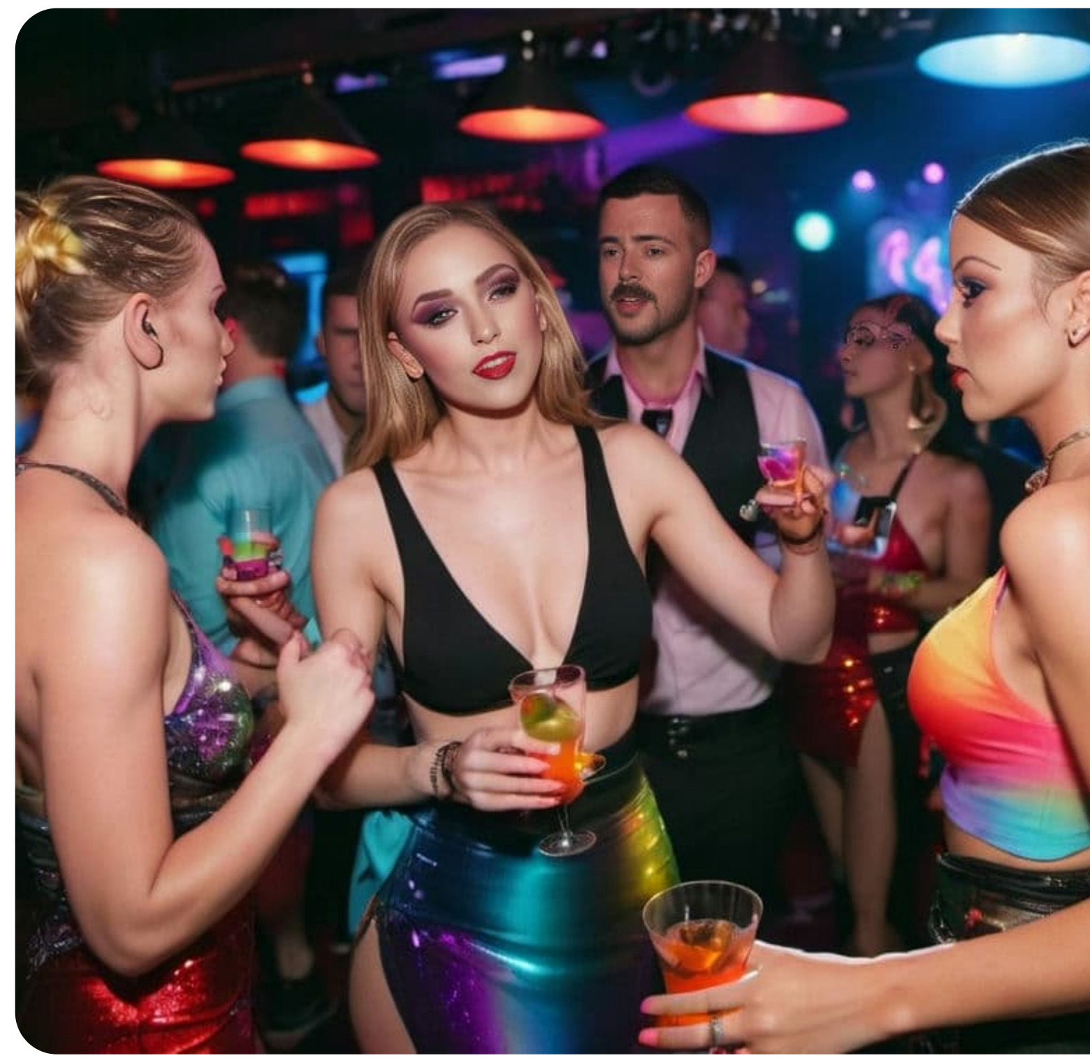
Transforming the Bar: Key Trends in Houston's Bartending Industry