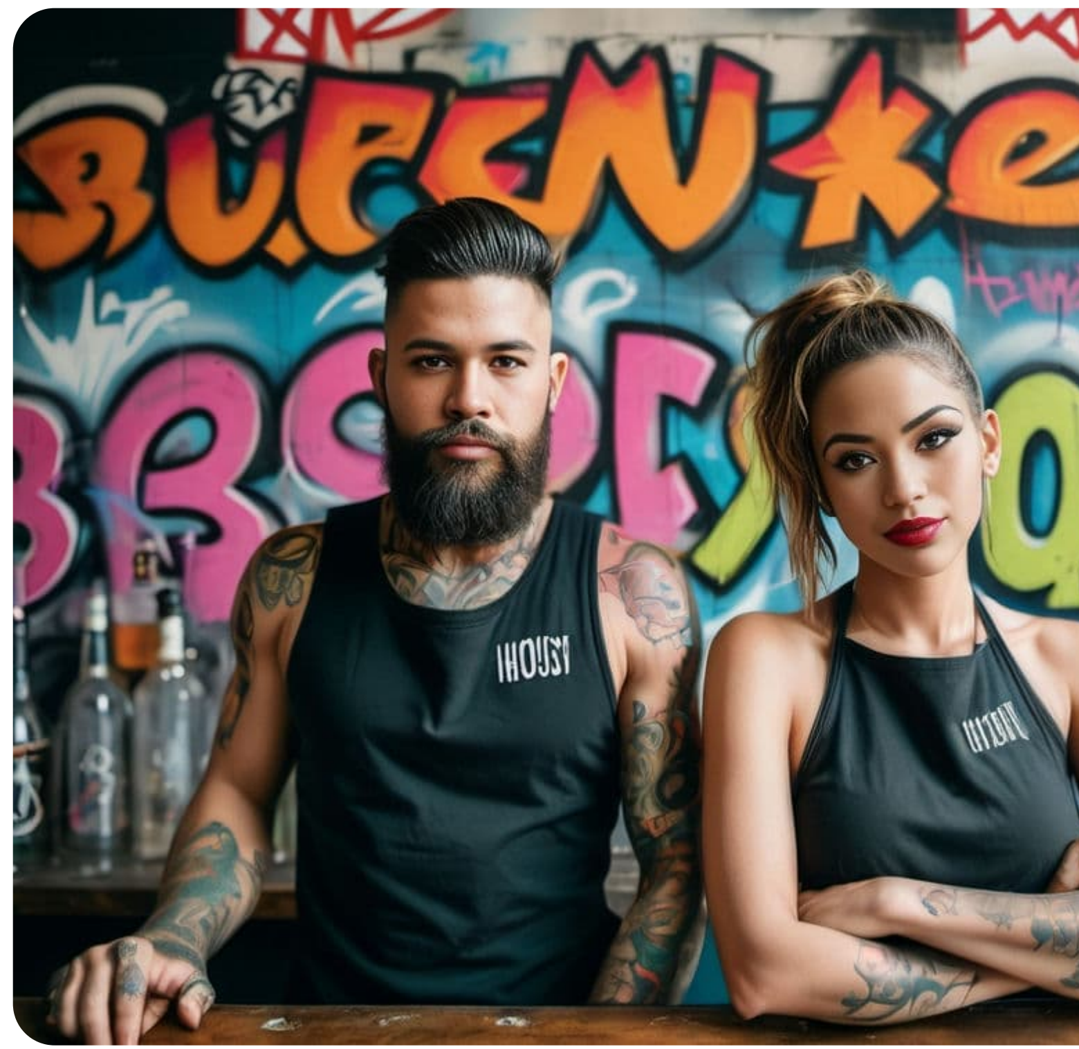
What's Hot in Houston's Bartending Scene: 2024 Trend Analysis